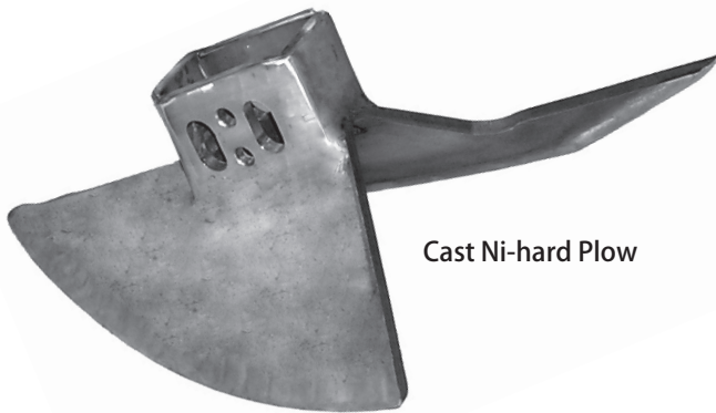
Cast Ni-hard Plow

Higher heat transfer coefficient, helps to break agglomerates with the higher shear input